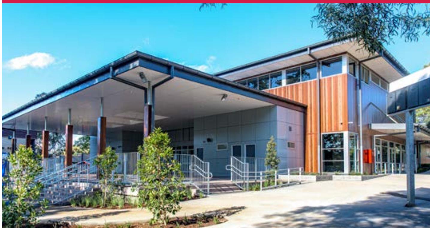
Ku-ring-gai High School upgrade – exterior of new hall