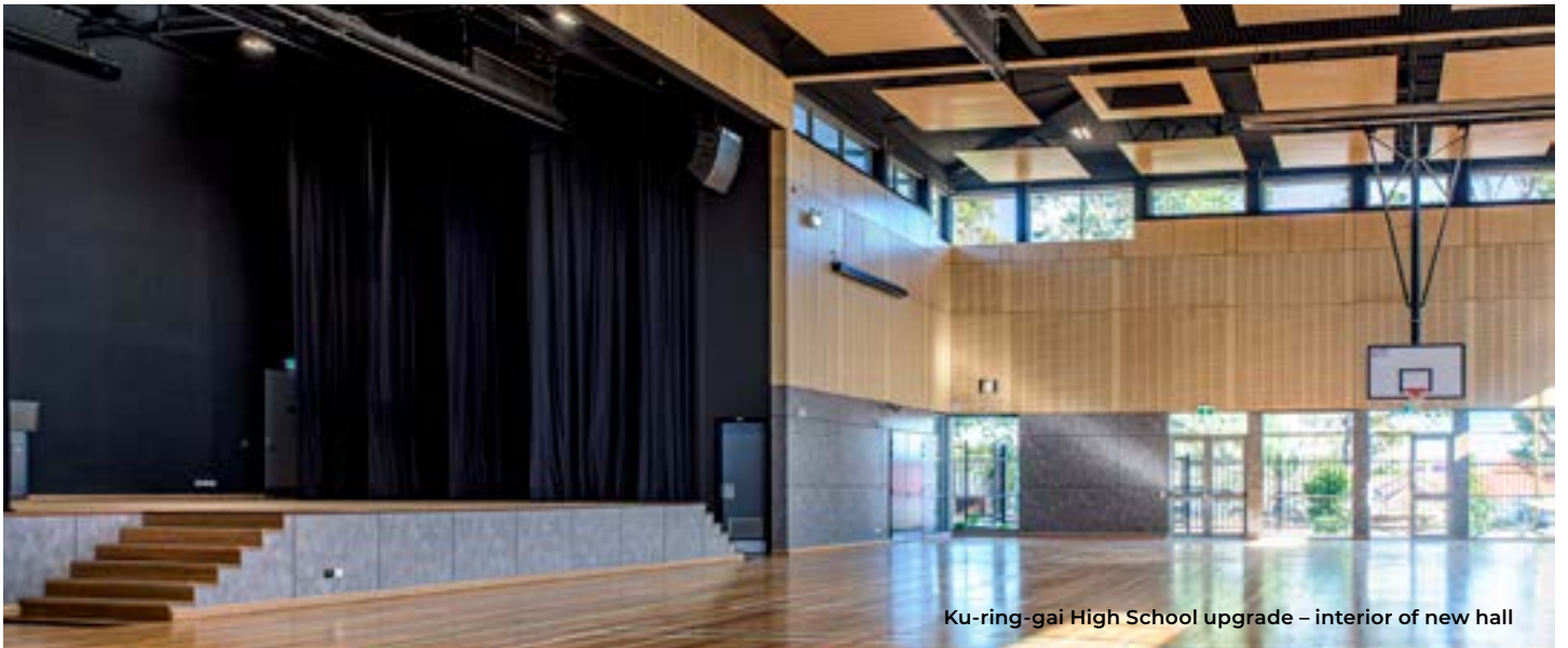
Ku-ring-gai High School upgrade – interior of new hall