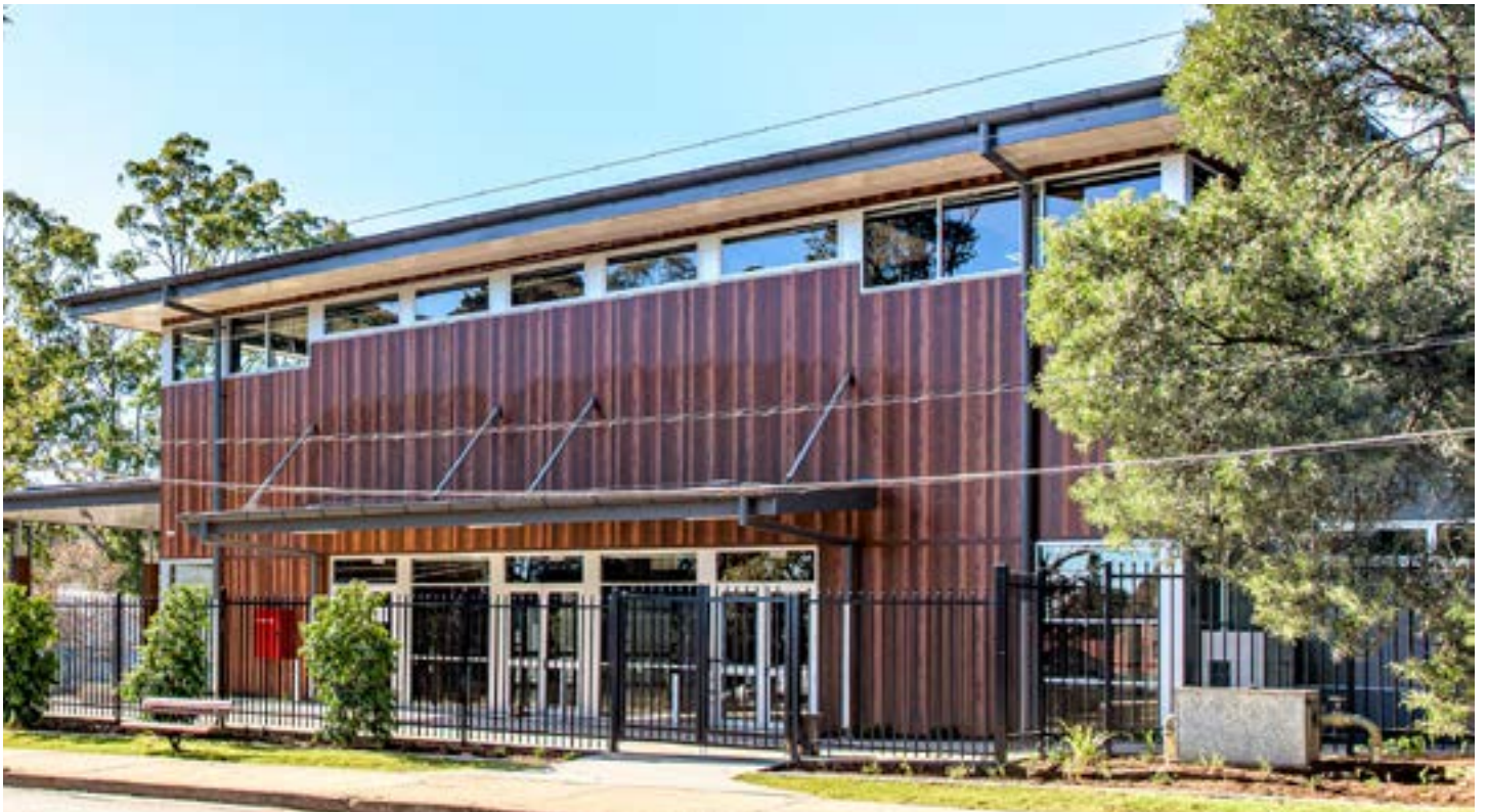
Ku-ring-gai High School upgrade – exterior of new hall