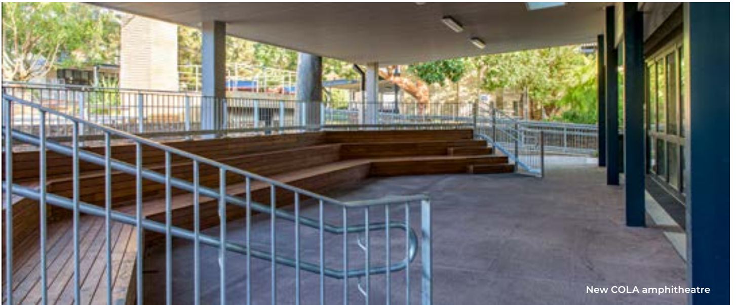
New COLA amphitheatre