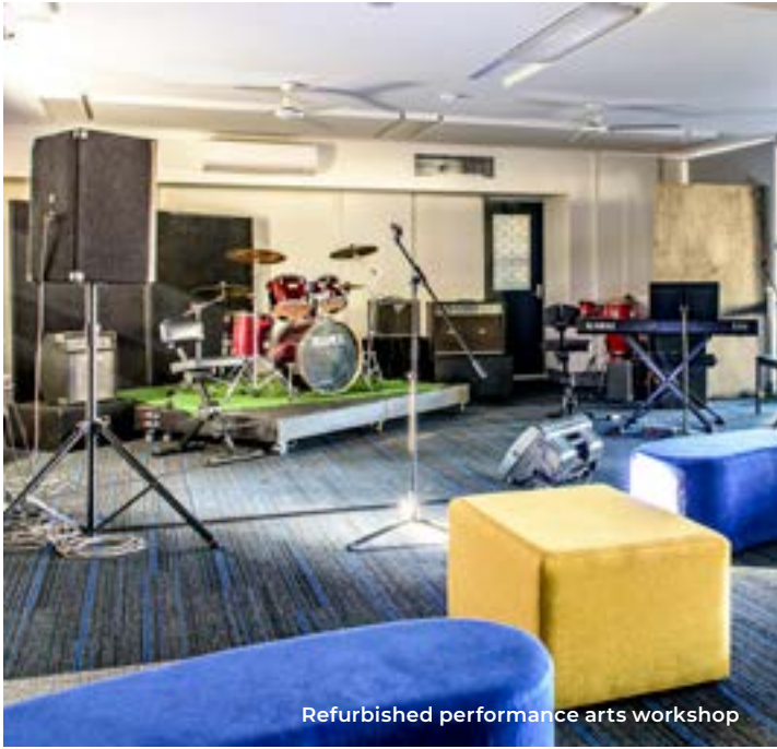
Refurbished performance arts workshop