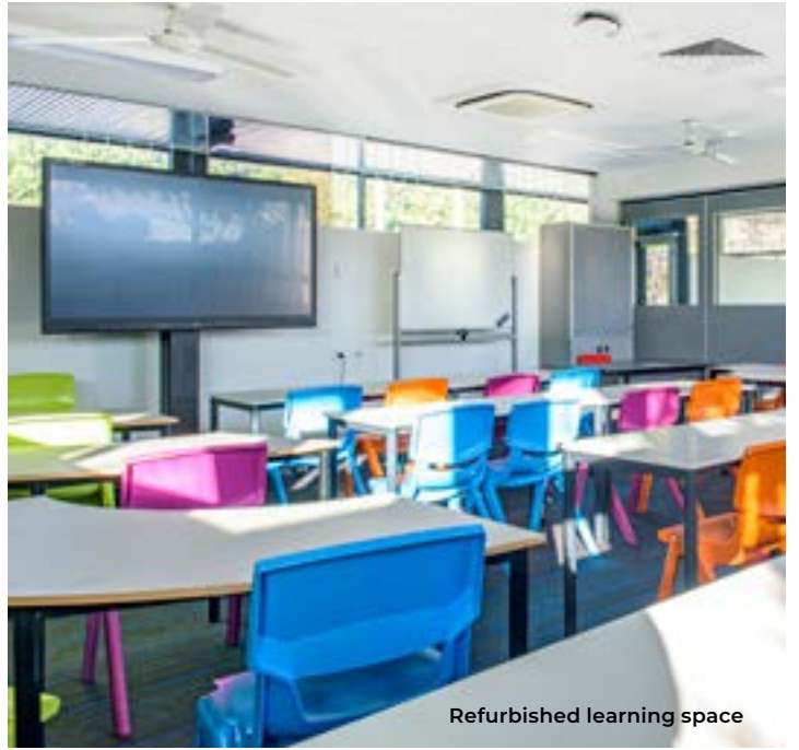
Refurbished learning space